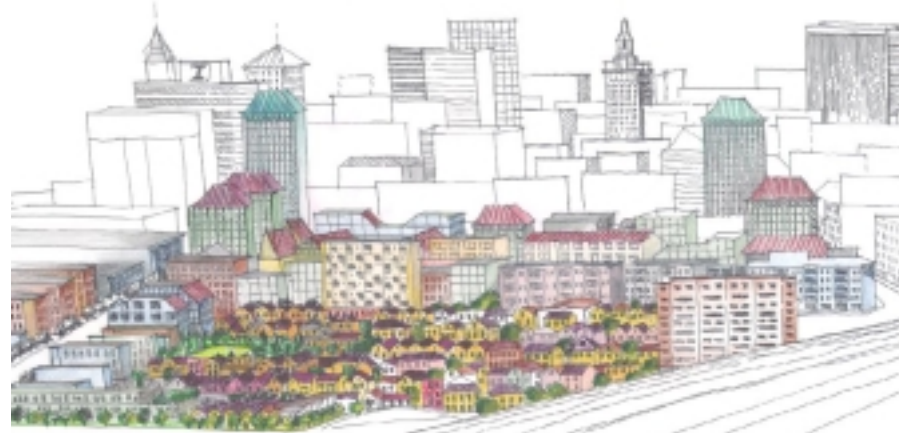
Telegraph-Northgate neighborhood as envisioned by its residents.