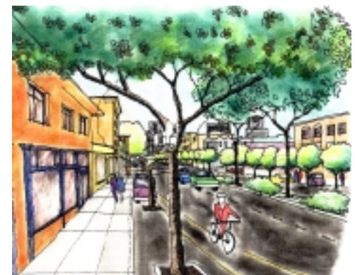
Telegraph Avenue bike lane and façade improvements.