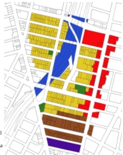
Proposed land use designations protect the character and affordability of the residential neighborhood while encouraging a dense transition zone towards the downtown area to the south.

With assistance from Urban Ecology, the Neighborhood Association is currently using the plan to guide new private development and advocate for park and streetscape improvements by the City of Oakland.